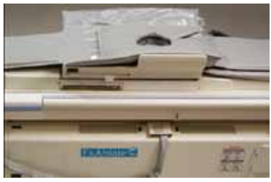
The MRgFUSA device embedded in the MRI table (ExAblate 2000, InSightec, Ltd, Israel)

Focused Ultrasound Ablation (FUSA) for Treatment of Breast Cancer Lumpectomy is the gold standard for surgical treatment of small breast cancers. It can be done as an outpatient procedure, with local anesthetic +/- sedation, with low morbidity, outstanding local control and good-to-excellent cosmesis in 90% of patients. Therefore the bar is high for treatments that may supplant it. One modality for the future is MRI guided, FUSA. It is a non-invasive, ambulatory, single session technique that does not require a temperature mapping probe. To date there are a small number of small studies. This is a technique which requires complex technology with currently very limited availability. However, nonsurgical ablative cancer therapies will become more commonplace in future. FUSA is now the subject of an FDA approved trial (David Brenin, Division of Surgical Oncology, University of Virginia).